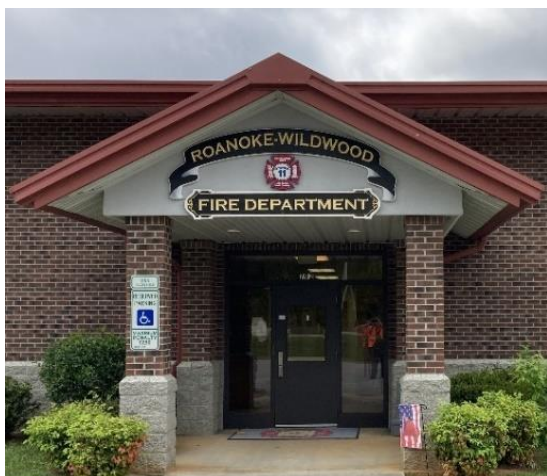
790 Lizard Creek Road, Littleton, NC 27850