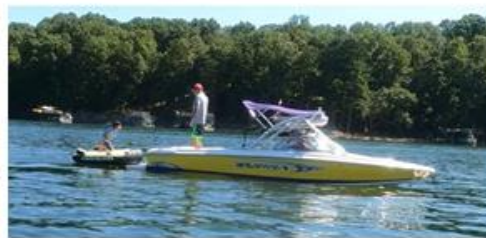
Boat Engine Turned Off !

And, on Kerr Lake, leaving a boat engine running when recovering tubers and throttle got bumped into reverse caused serious injury.